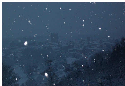
Richmond in the Snow

I believe too that they'd rise again to defend fair England's shores in our hour of need, these brave brothers of our forefathers.